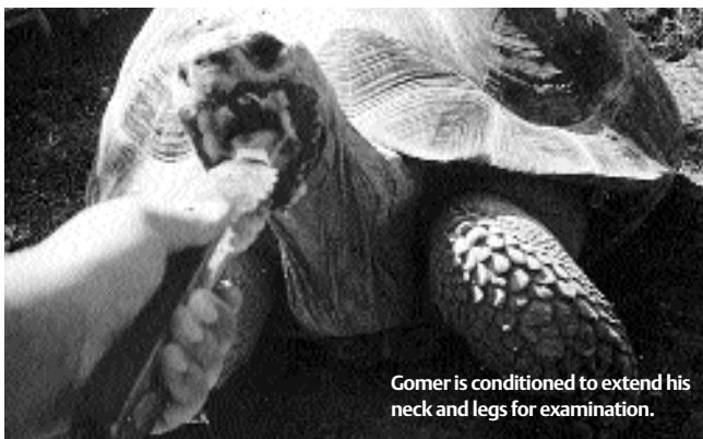
Gomer is conditioned to extend his neck and legs for examination.