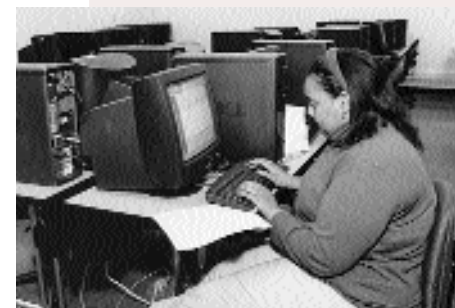
A quantitative psychology student works at one of the 31 computer stations in the new state-of-the-art lab/classroom in DeGarmo Hall. The station runs SPSS and LISREL in addition to the standard lab suite of software.